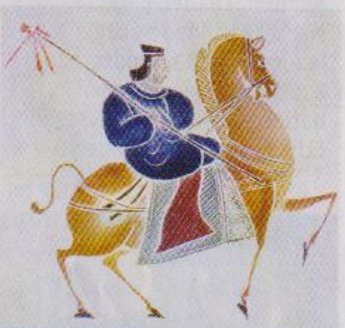
Political order An excellent new book by Francis Fukuyama says that a strong state, the rule of law and accountability bring political order. Castration can help too, page 76